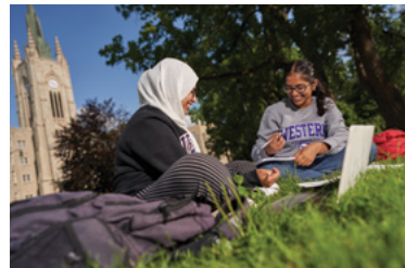
1,300+ acres of campus and green space