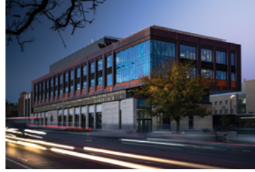
Amit Chakma Engineering Building, one of many campus buildings that feature collaborative learning, teaching and study areas

Western is located in London, Ontario, a city renowned for excellence in education and health care, lively arts, culture and sports scenes, and lots of recreational opportunities.