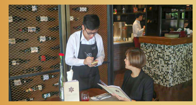
▲季節(教學餐廳) The Seasons (M.U.S.T. Training Restaurant)