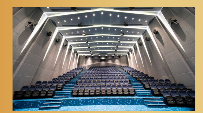
▲ 影視廳 Movie Hall