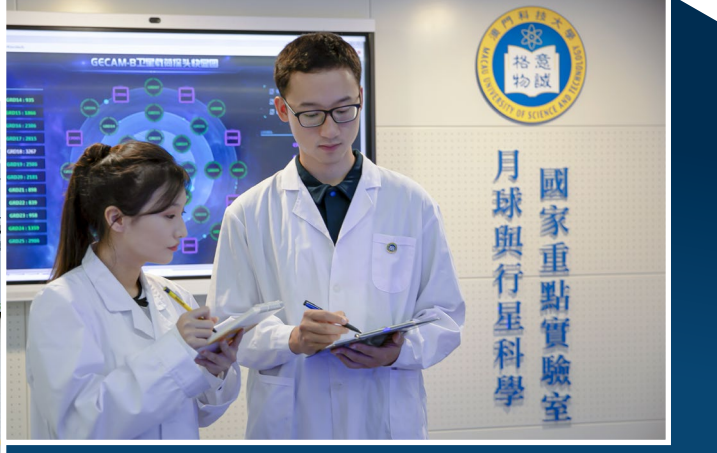
▲ 月球與行星科學國家重點實驗室 State Key Laboratory of Lunar and Planetary Sciences

校園內設置了便利店、銀行中心、學生餐廳、教學餐廳、廚藝天地、咖啡 閣、電腦店和具奧林匹克運動會標準的田徑運動場、室內體育館和網球場 等設施,提供學生鍛練和衣食住行便利的場所。位於大學校園內的科大醫 院為學生提供 24 小時校醫支援服務。科大醫院設備先進,除擁有本地專業