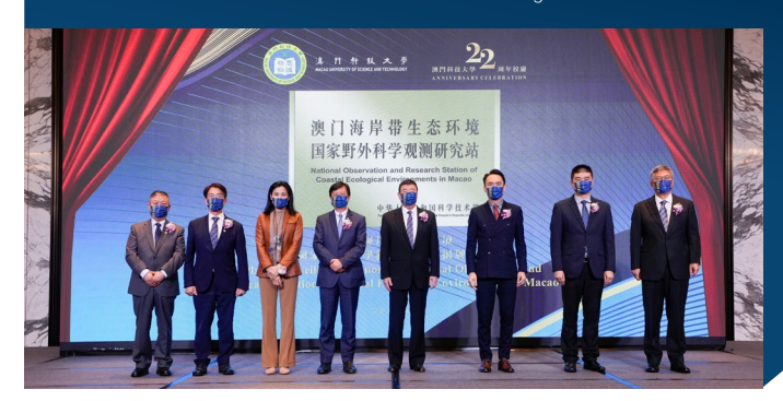
▼ 澳門海岸帶生態環境國家野外科學觀測研究站 National Observation and Research Station of Coastal Ecological Environments in Macao

2023 年 5 月,內地和澳門合作研製的首顆空間科學衛星——「澳門科學 一號」衛星,在酒泉衛星發射中心成功發射,位於大學校園內的澳科衛星 科學與應用數據中心、澳科大衛星地面站也正式投入使用,未來將繼續推 進在軌測試、科學數據分析及研究工作。