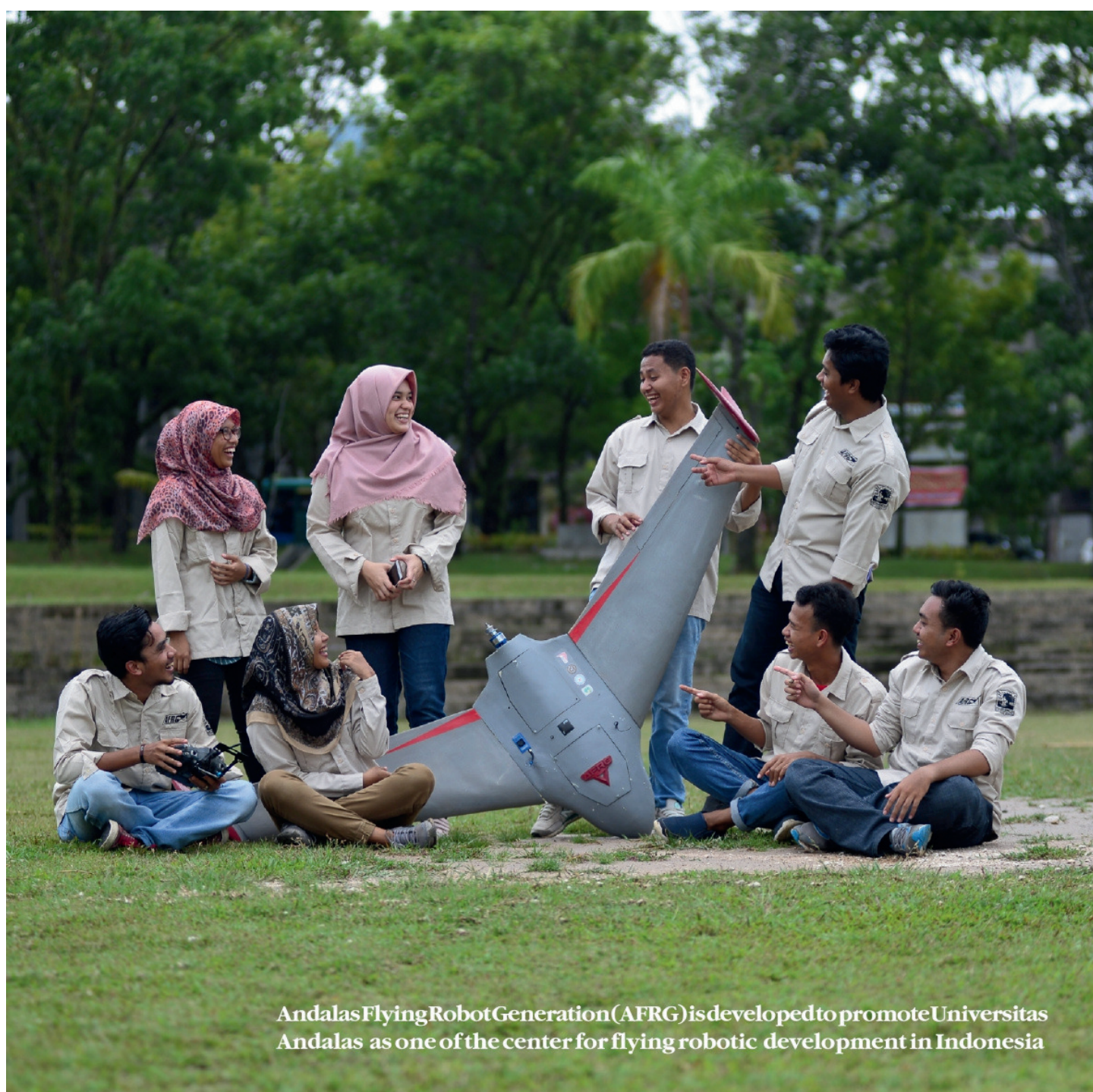
Andalas Flying Robot Generation (AFRG) is developed to promote Universitas Andalas as one of the center for flying robotic development in Indonesia