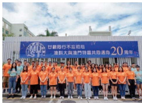
▲ 交換生及國際學院學生大使合照 Exchange students and UIC buddies