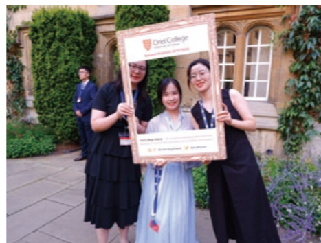
▲ 英國牛津劍橋暑期項目 Summer Program in University of Oxford and University of Cambridge, UK