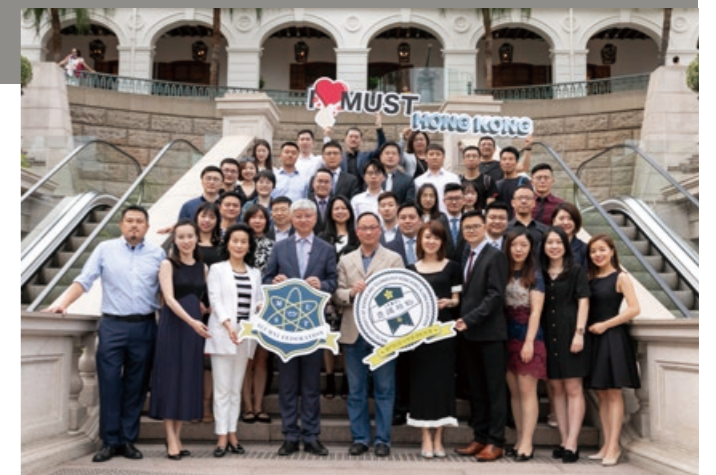
▲ 澳科大校友會活動 Activity of MUST Alumni Federation

Alumni work at global top 500 companies, become entrepreneurs, become major forces of the political and economic society of Greater Bay area, or continued their educational journey. The Federation of M.U.S.T. alumni has founded associations in cities such as Macao, Guangzhou, Shenzhen, Beijing, Taiwan, Shanghai, etc. More and more associations are constantly created to build a warm and solid alumni network.