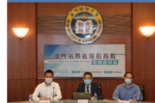
▲ 大學可持續發展研究所舉行「澳門消費者信心指數 2020 年第 2 季」調查新聞發佈會 The news conference held by the Institute for Sustainable Development of the University to release the "Macao Consumer Confidence Index in Q2 2020"

大學在致力科學研究和人才培養外，還利用自身的學科優勢為社會服務。努力在學術研究、政策建議、社會服務等領域產出具有創新性、實用性和影響力的研究成果，成果涵蓋社會、經濟、民生等多個領域。如在疫情爆發初期，醫學院張康教授團隊研發的“面向新冠肺炎的全診療流程的智慧篩查、診斷與預測系統”，可對大量疑似病例進行快速篩查、輔助診斷和住院臨床分級預警。