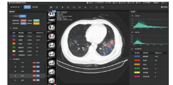
▲ 新冠肺炎 AI 影像輔助診斷 (CT 診斷) 介面 The interface of AI System for Screening, Diagnosis and Prediction of Covid-19 Pneumonia