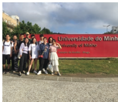
▲ 國際學院學生赴葡萄牙米尼奧大學交換 MUST exchange students at University of Minho, Portugal