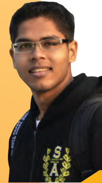
Sri Lanka BEng in Electronics and Communications