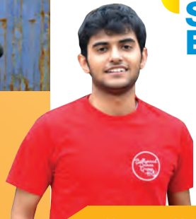
India BEng in Electronics and Communications