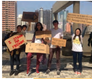
Russia Bachelor of Journalism

Thanks to my experience just after the first year at HKU, I managed to find an internship at Russia Today TV News channel for my first summer. I found out that my studies at HKU was a major deciding factor for them to give me this opportunity. One of the things I was required to do was talk for a length of time about a prominent current affairs issue in front of a camera. Having learned (at length!) how to best report news in my first year, the report I wrote about current China - Russian relations impressed those at RT, and got me hired.