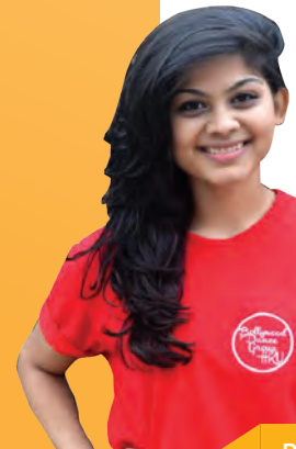
India Bsc. Biotechnology